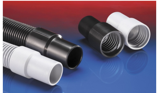
With End Couplers